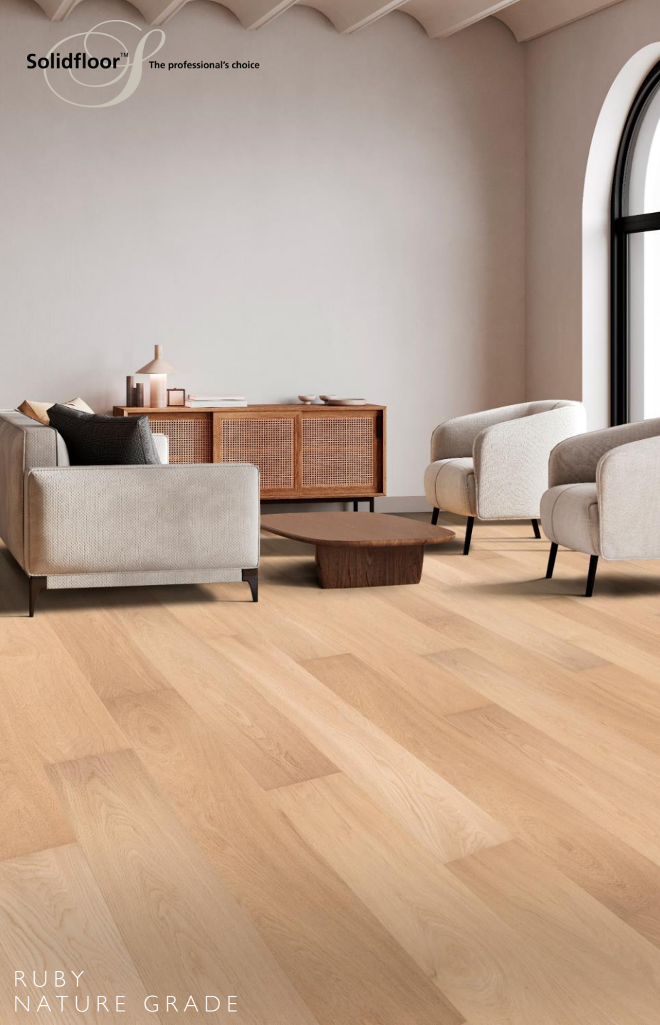
RUBY NATURE GRADE