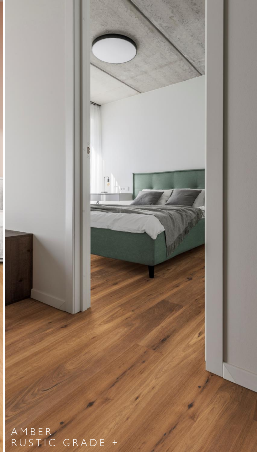
AMBER RUSTIC GRADE +