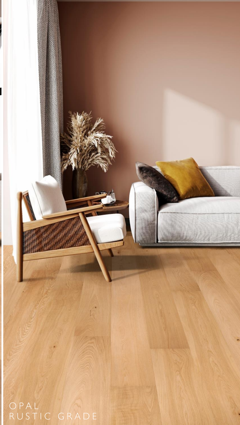
OPAL RUSTIC GRADE